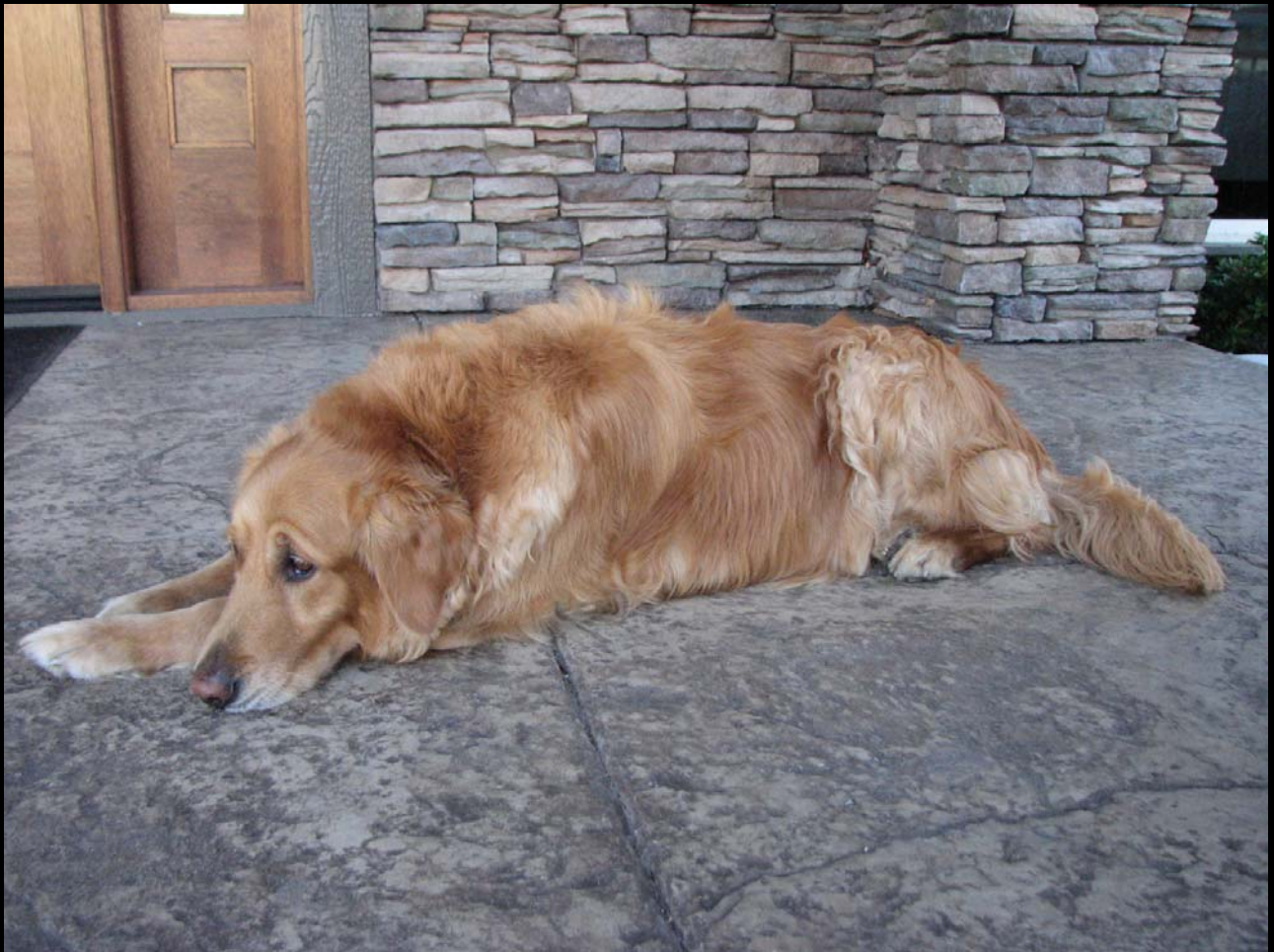
Foster is waiting for you to stop by CSA Planning and get acquainted.